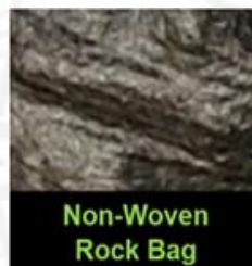
Non-Woven Rock Bag