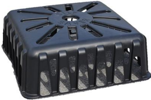
Low Profile for Non-sump use Square 42" X 42" X 16"