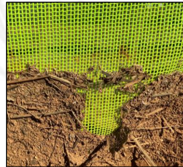
Natural floatables contribute to filtration on green mesh of velocity restrictor sheet