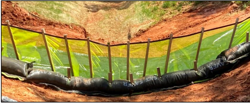
Front water seal with compression tubes and stakes