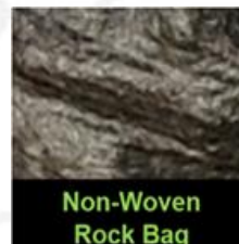
Non-Woven Rock Bag