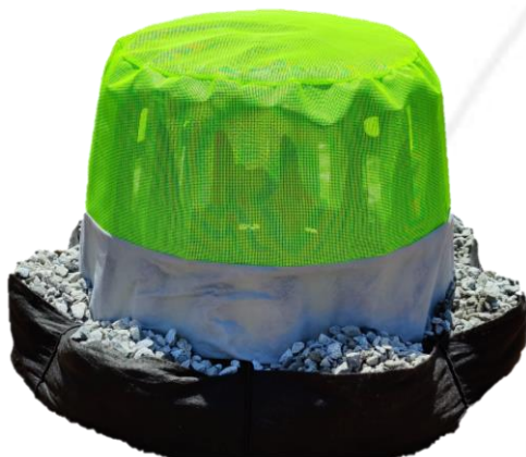
Two Replaceable Filter Options