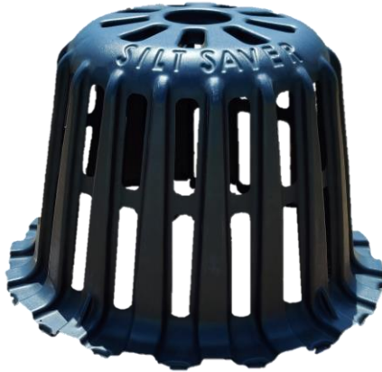
Round Base 38"