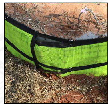
Internal grid provides structural support