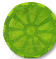
High Flow Filter