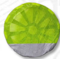
2 Stage Filter

50% high flow green mesh 50% nonwoven (>96% efficiency) filter